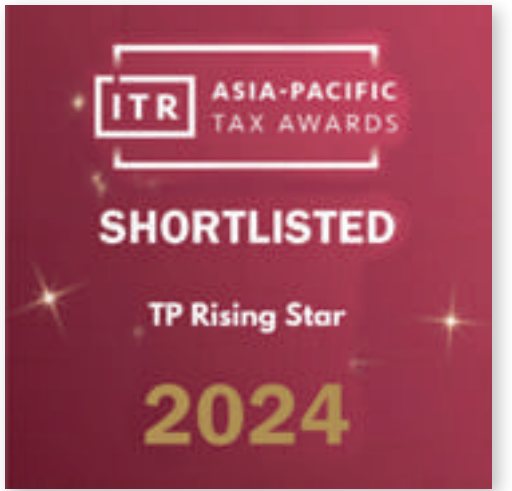
Our Awards & Recognitions